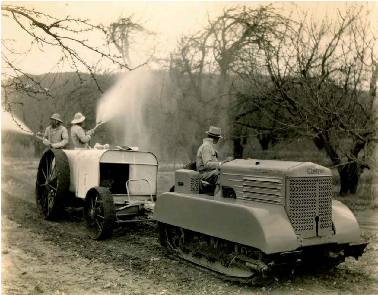
Figure 4. Richard V. Messina driving the tractor, with workers spraying the orchard trees, 1952